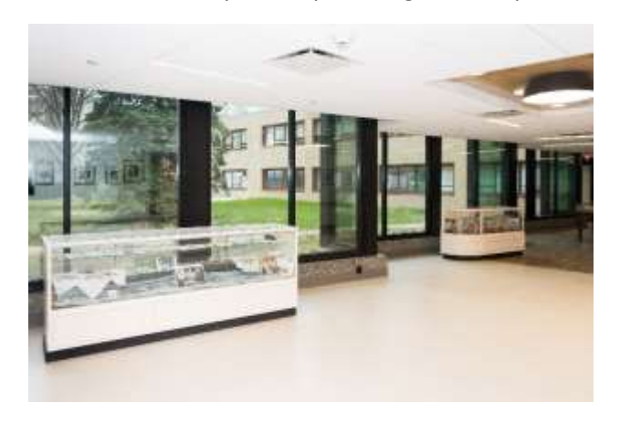
An overview of the Grace Kelly gallery space.

The facility is also providing a small space nearby as a central location for our office.